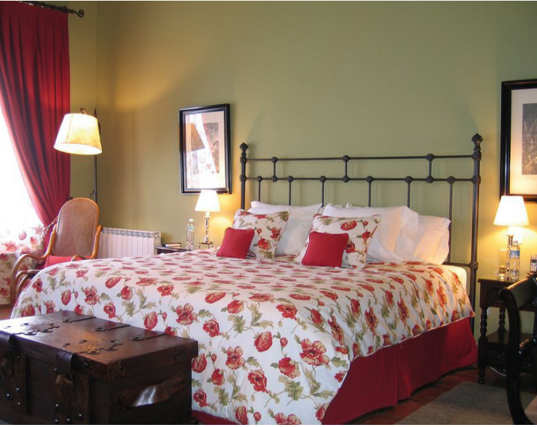
CAFAYETE | Patios de Cafayate Wine Hotel

In the middle of the vineyards of the El Esteco winery and with the Calchaquí Valleys in the background, the original part of this estate, founded in 1892, is today part and soul of this incredible 32-room country hotel.