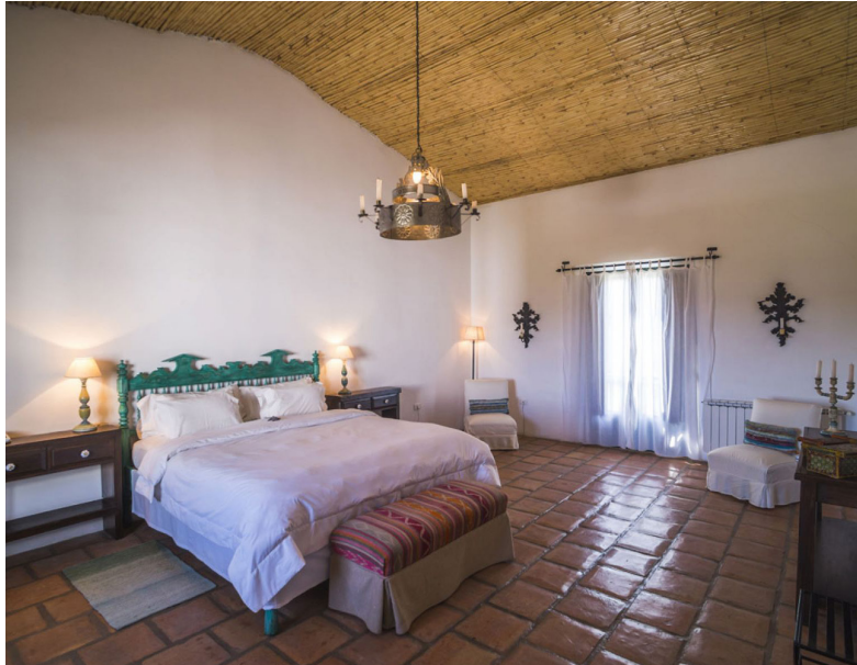
CACHI | La Merced del Alto Hotel & Spa

Every afternoon our guests can enjoy a complimentary glass of sparkling wine.